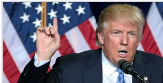
Donald Trump has picked trade fights with China and now Europe.

It is also right to hear Poulsen stress the importance (and growing dominance) of Asian shipowners, particularly in China. But there is also a clear message to the European Union, which is singled out for mention, perhaps because of its strong stance on environmental regulation.